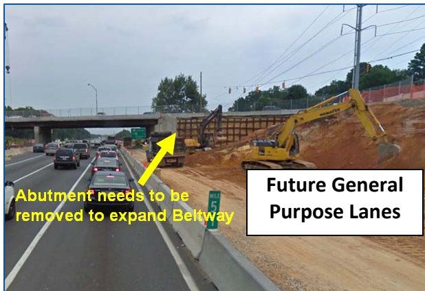
Abutment needs to be removed to expand Beltway